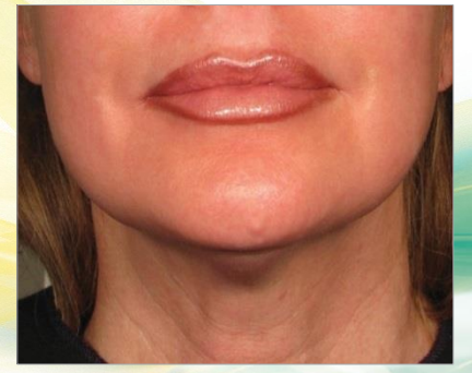
After 90 Days